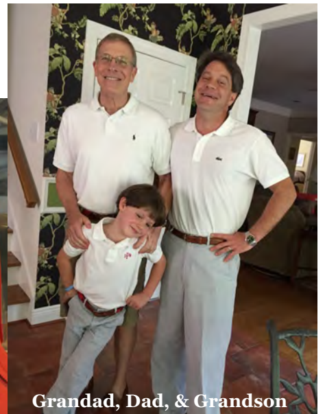
Grandad, Dad, & Grandson